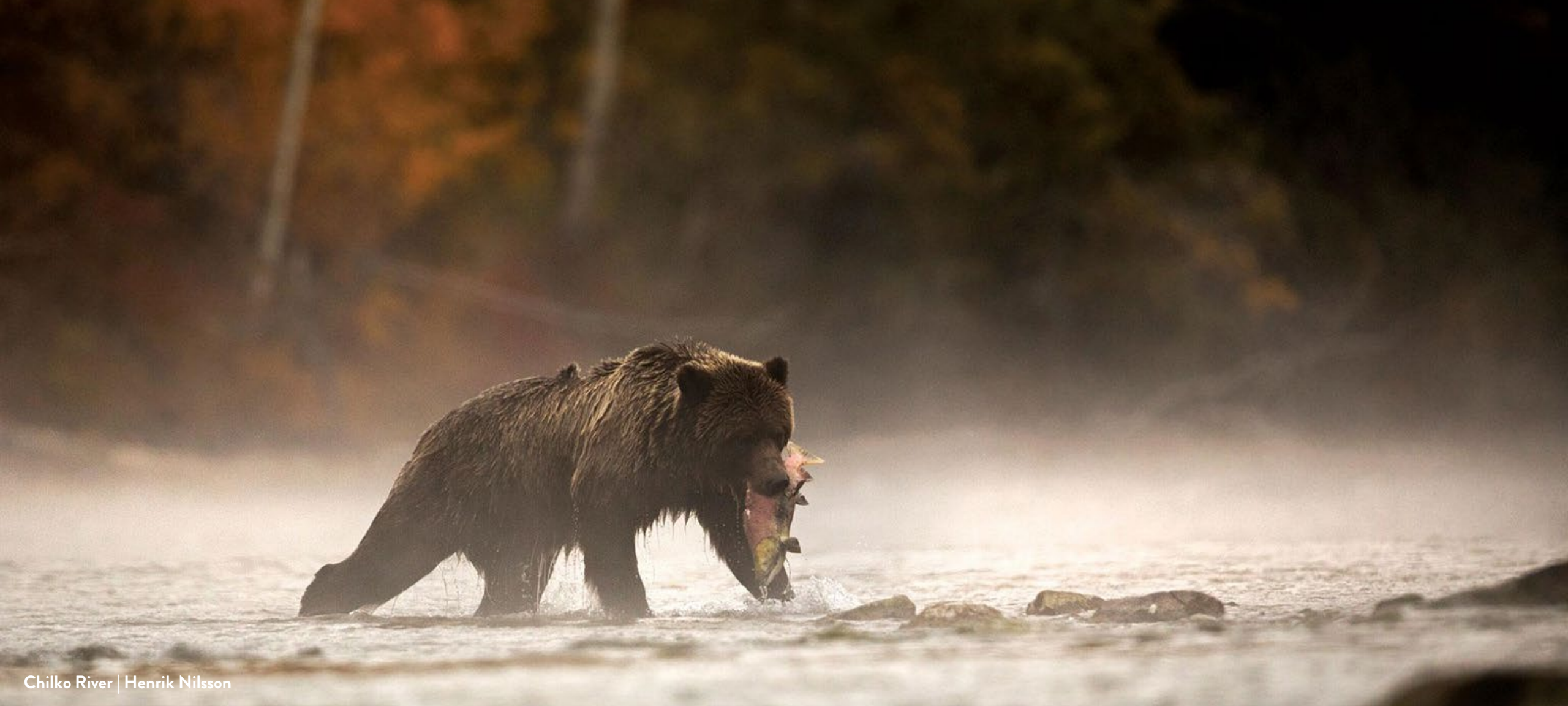
Chilko River